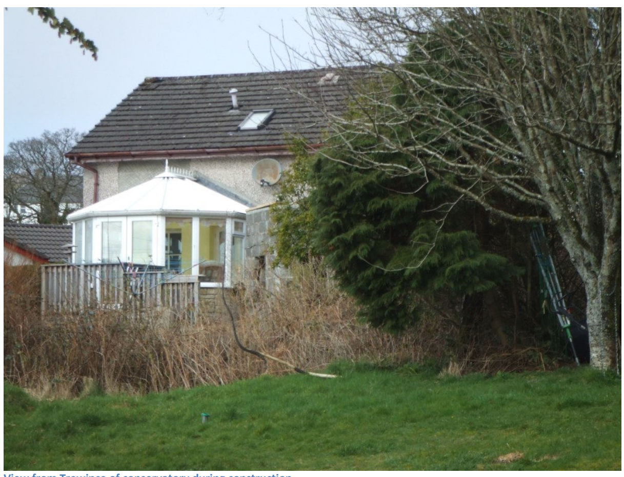
View from Trewince of conservatory during construction