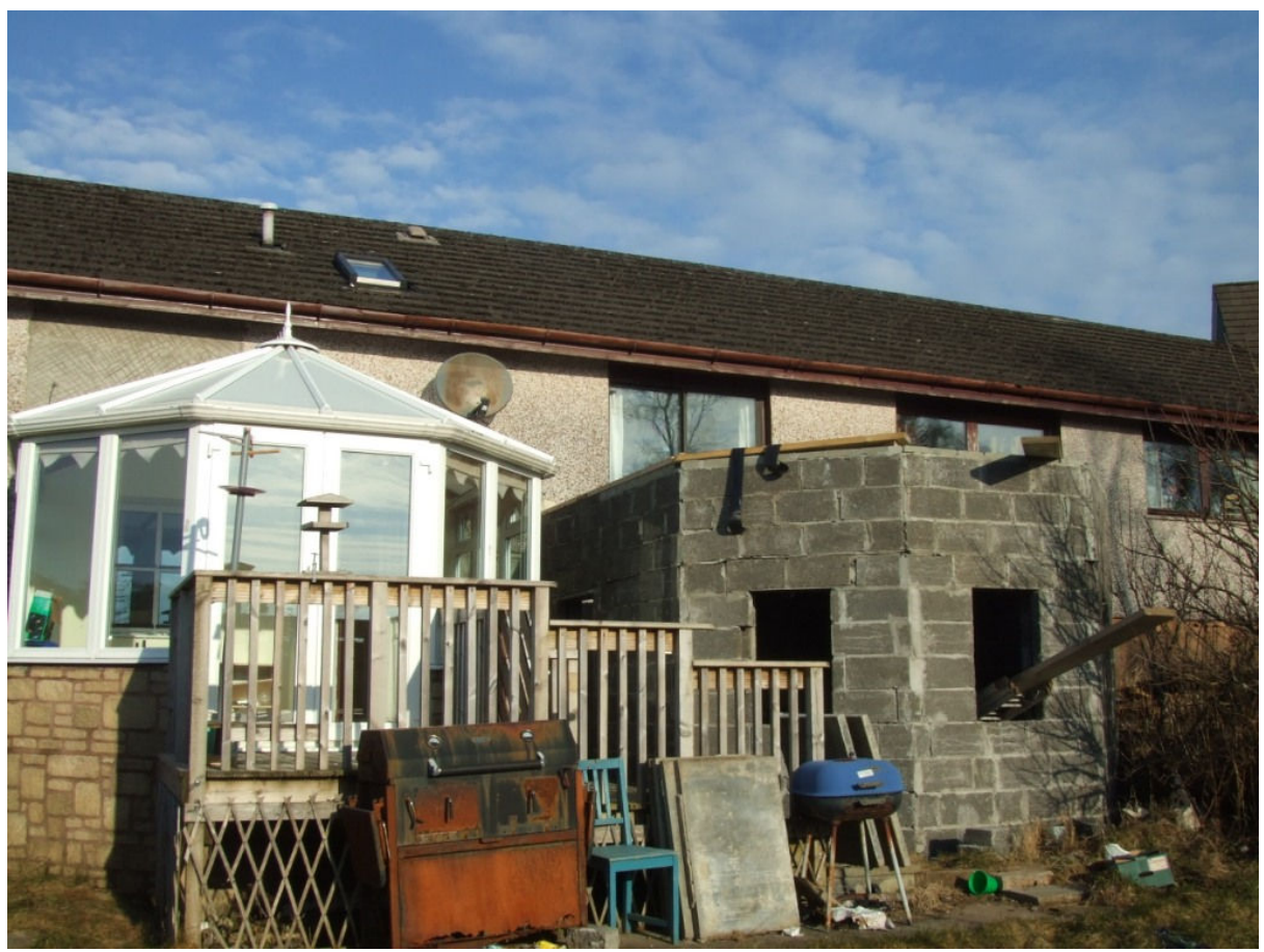
View of conservatory during construction