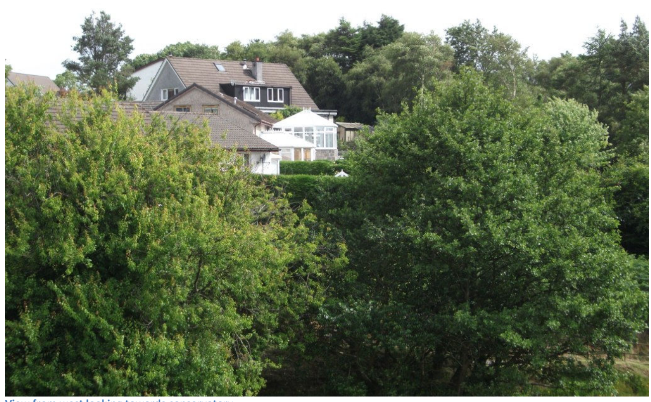
View from west looking towards conservatory