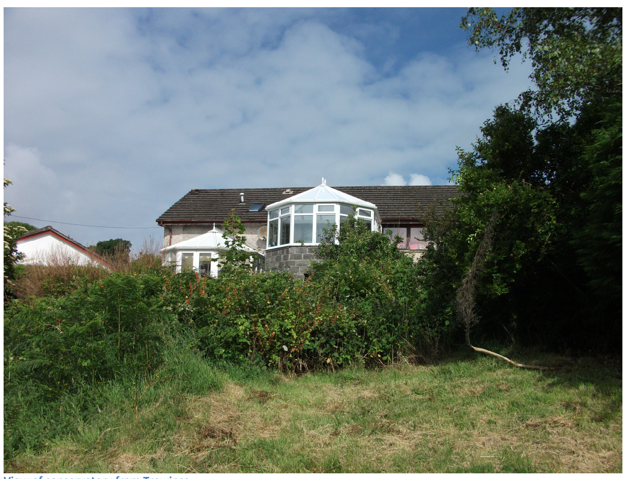
View of conservatory from Trewince