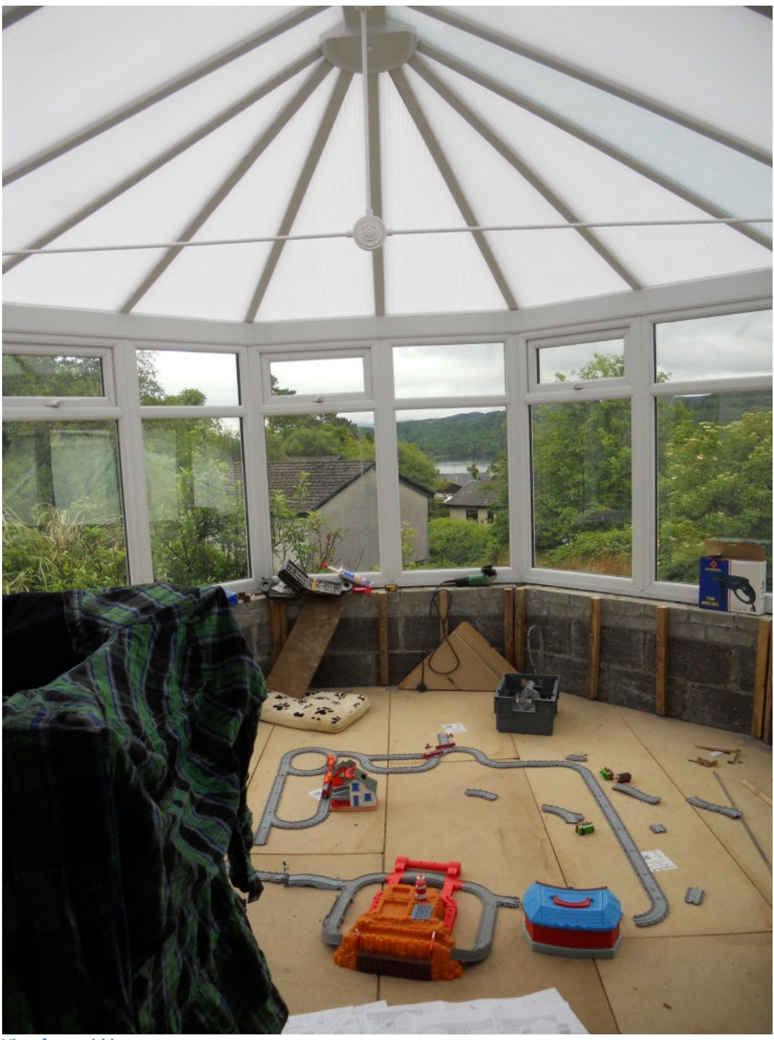
View from within conservatory