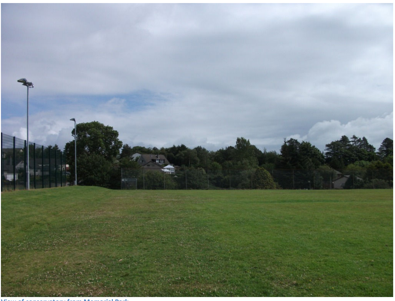
View of conservatory from Memorial Park