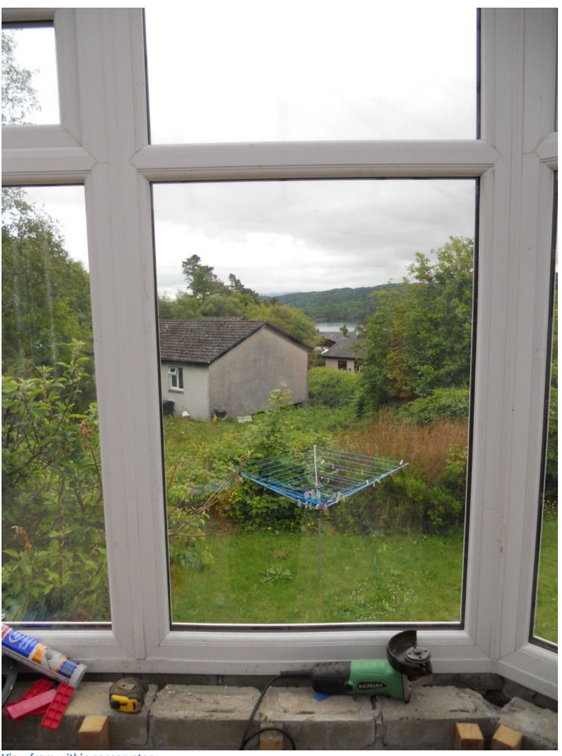
View from within conservatory